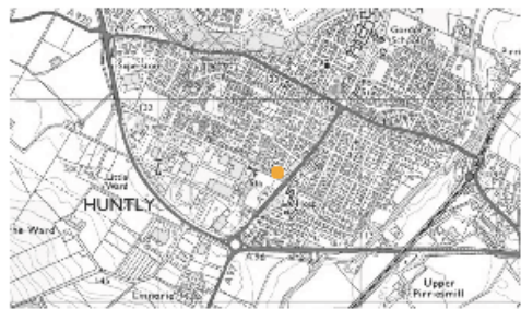
OS Map Scale 1:25,000