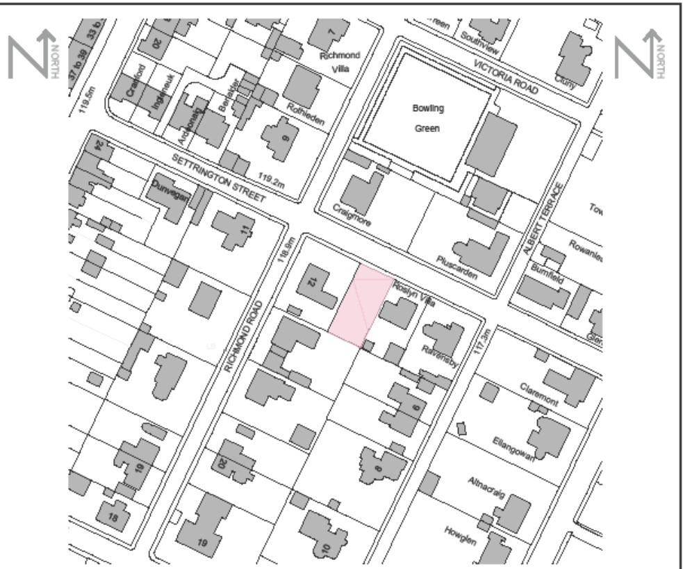
Location Plan Scale 1:1,250