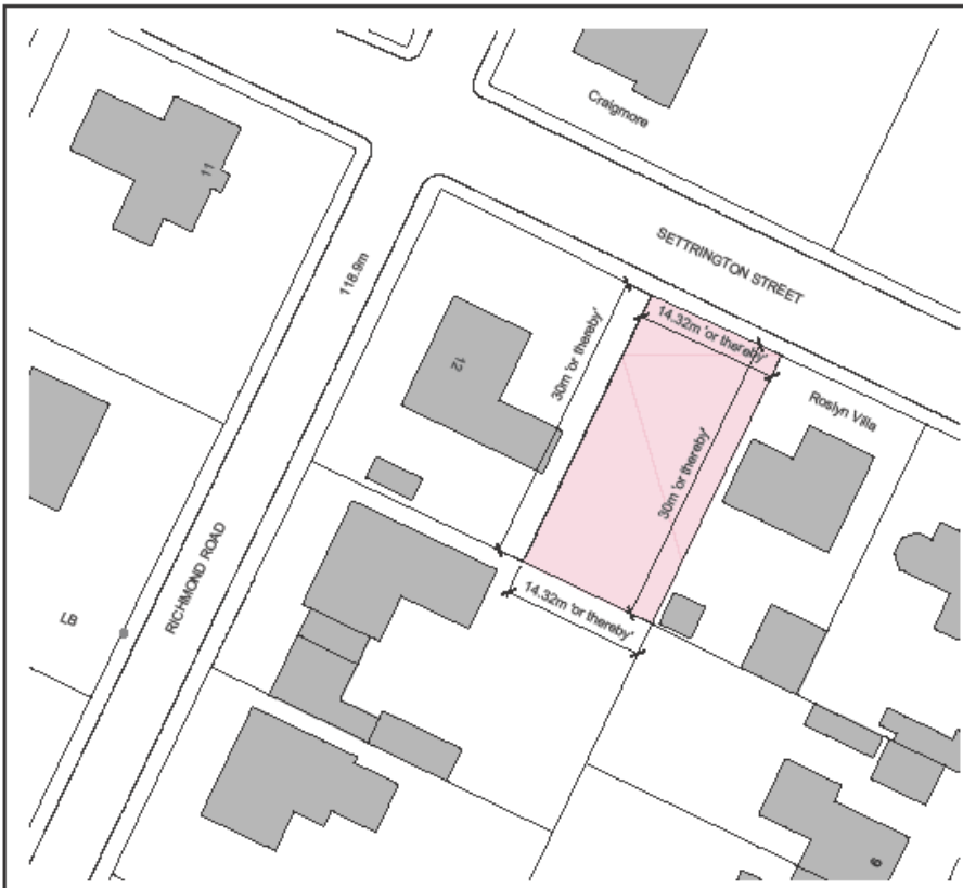
Site Plan Scale 1:500